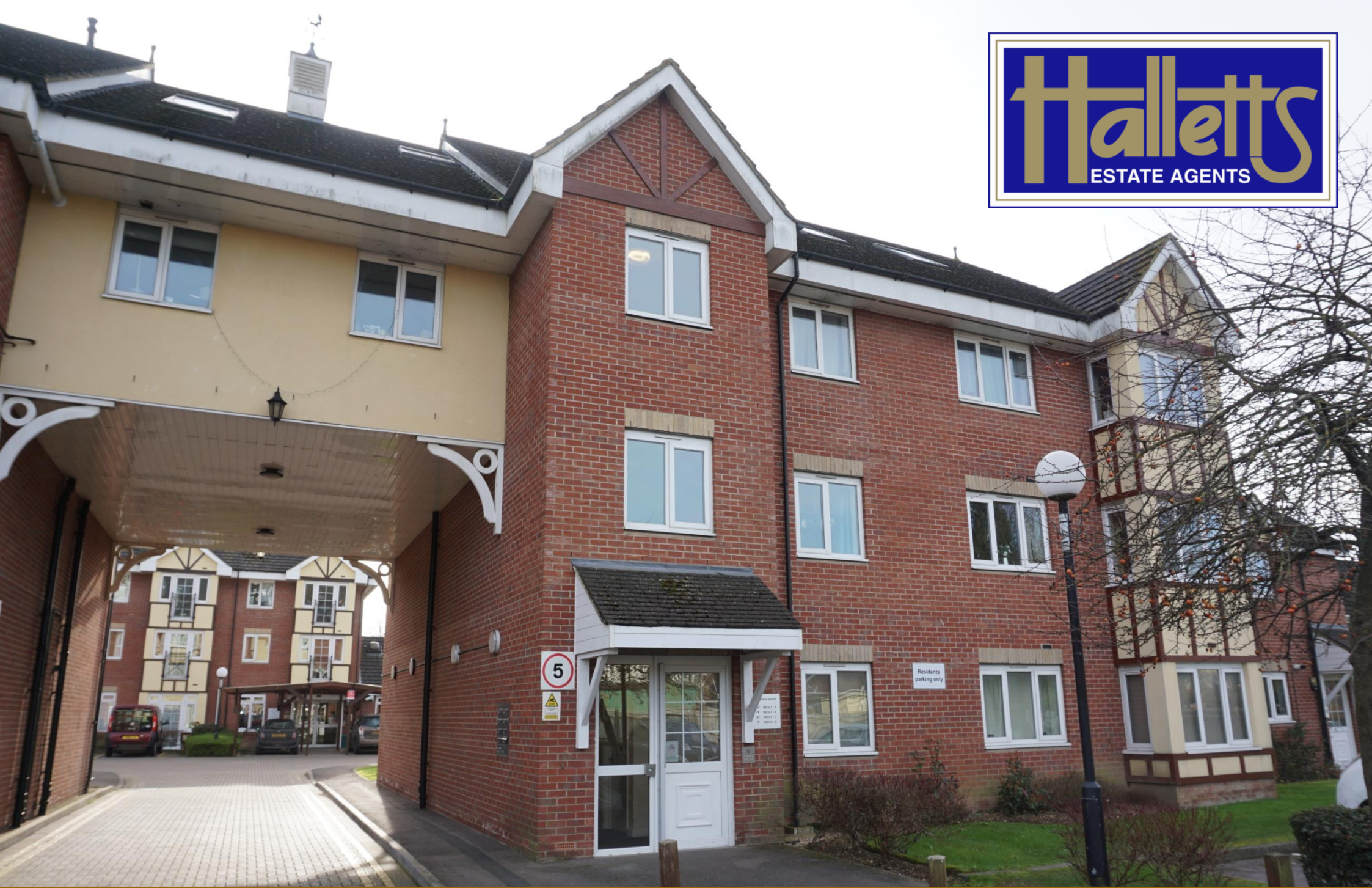
3 Victoria Grove Newbury Berkshire RG14 7RA